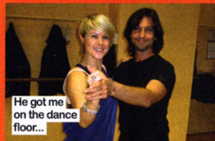
He got me on the dance floor...