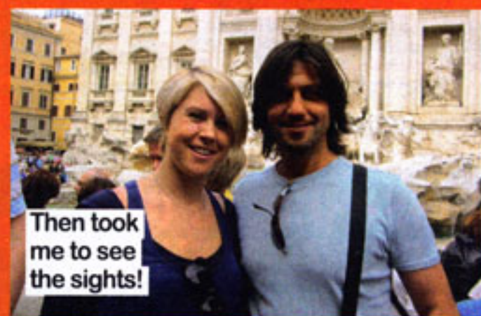
Then took me to see the sights!