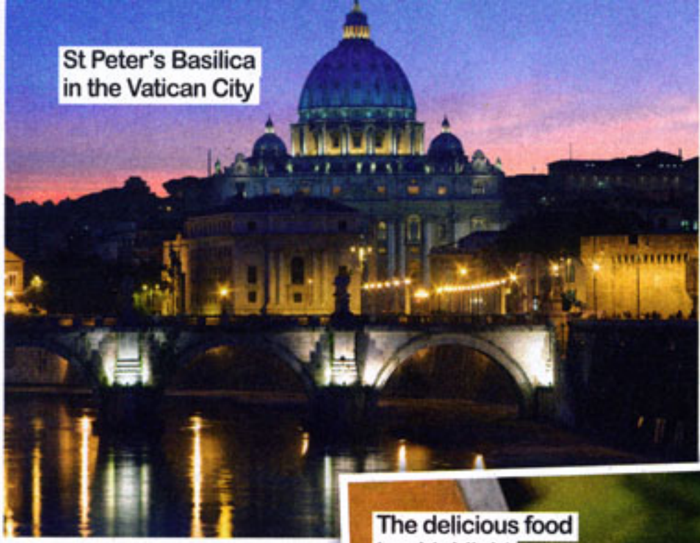
St Peter's Basilica in the Vatican City