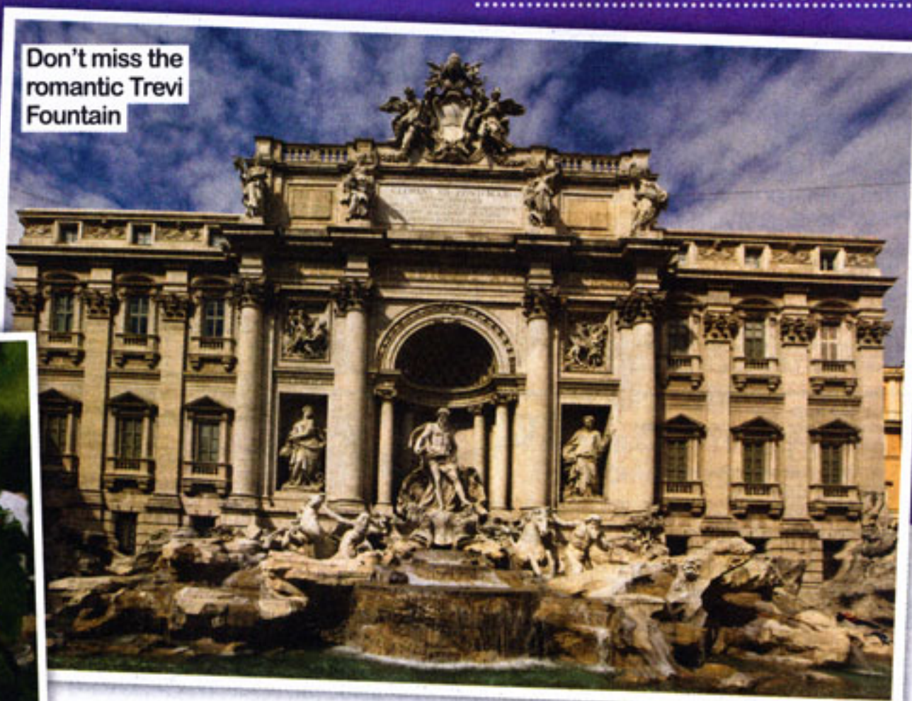
Don't miss the romantic Trevi Fountain